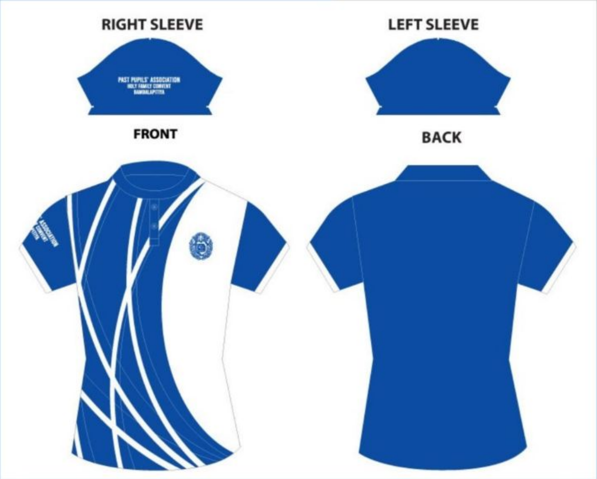
Ladies - Tops Size Chart